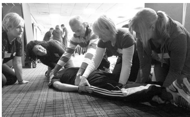
Figure 1 Prone log roll training.

Semirigid collars are, however, not without their own controversy with studies suggesting that they may offer little protection from excessive intersegmental motion of the cervical spine in stable or unstable vertebral columns. 6 This is despite various designs and styles. The cadaveric model on which many of these studies are based have, however, been challenged as a poor model. 7