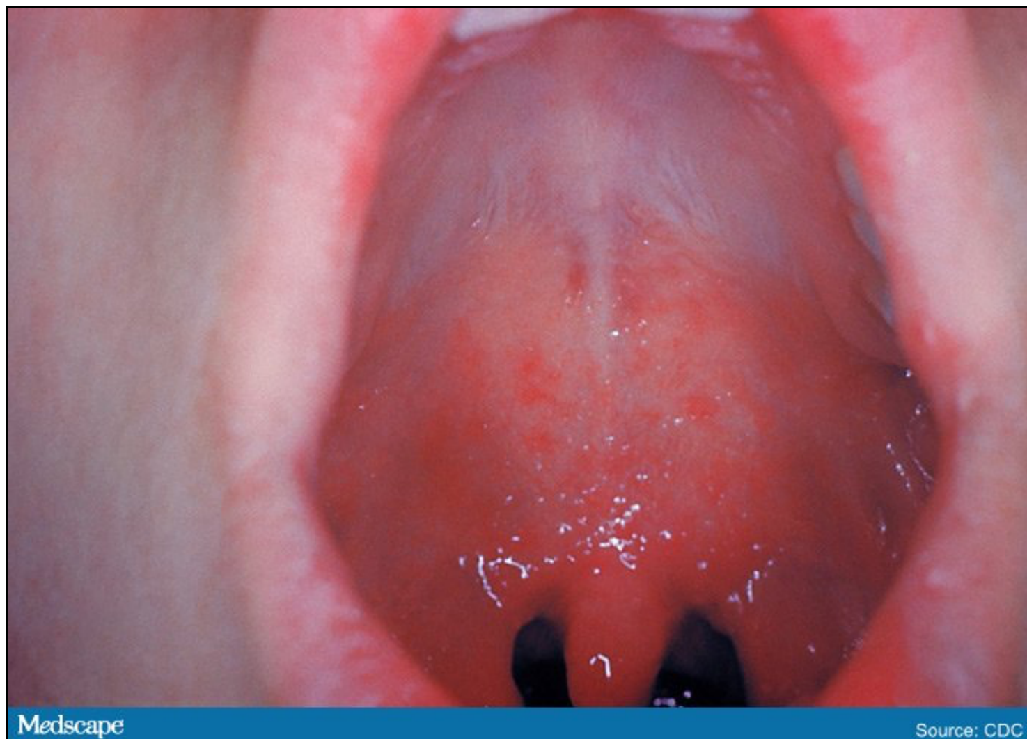
Figure 1. Koplik spots.

After an incubation period of 8-12 days after exposure, the prodromal symptoms begin with fever, cough, coryza, and conjunctivitis (the "three Cs"). [4,5] During this period, Koplik spots—bluish-white lesions on a red base—may appear on the buccal mucosa, most often opposite the molars.